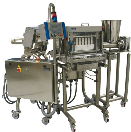
■ Automatic tortellini machine