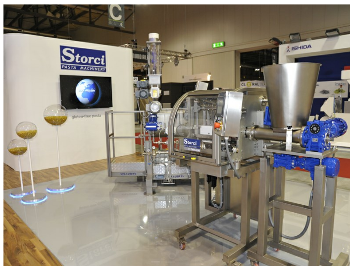
■ Automatic tortellini machine at Ipack Ima Trade Fair 2015