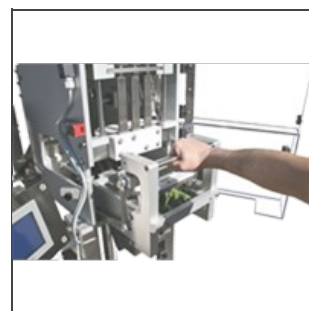
Fast size change