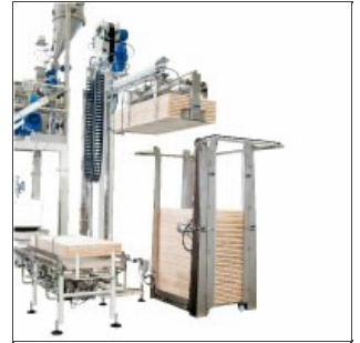
Robo XI tray stacker