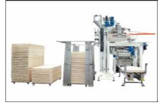
Robo XD tray destacker

Specifically conceived for Storci lines, ideal for all other lines.