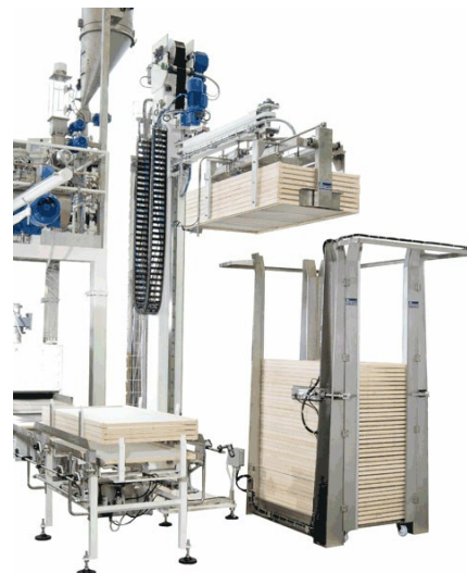
■ Robo XI tray stacker