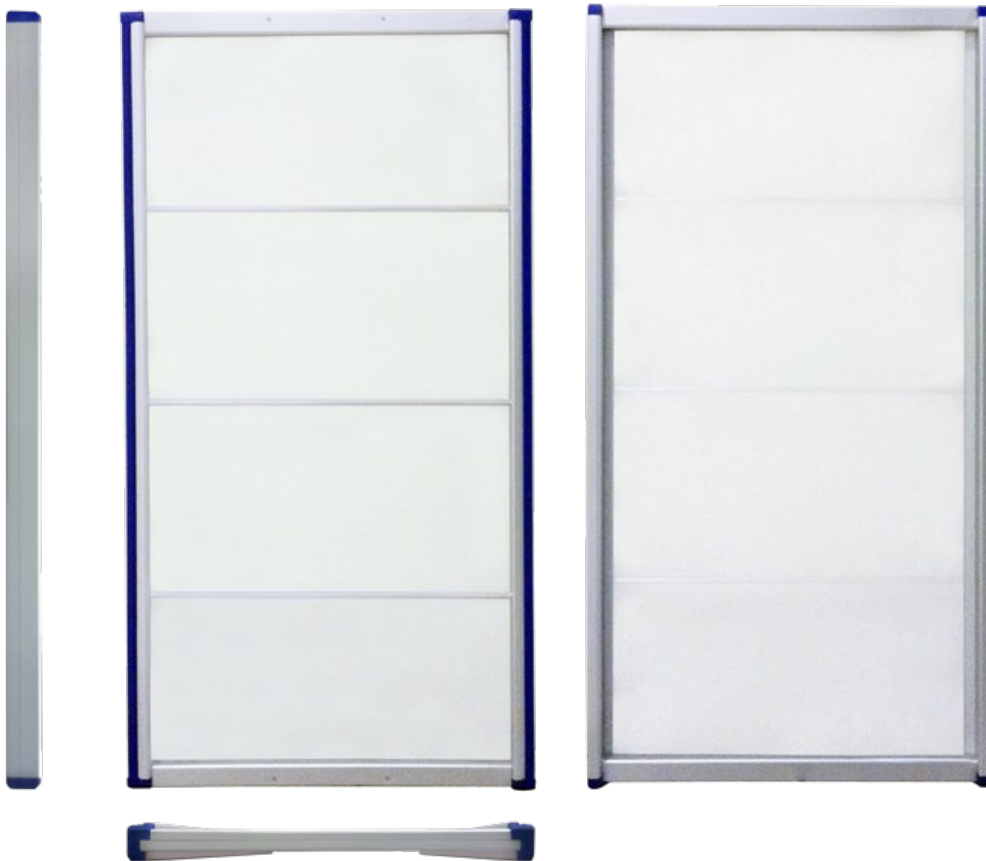
■ Stainless steel trays