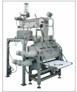
Application Premix® on Beltmix

Our test facilities are always available, without obligation, to demonstrate how the Premix® functions, including using the customer's own ingredients and recipes.