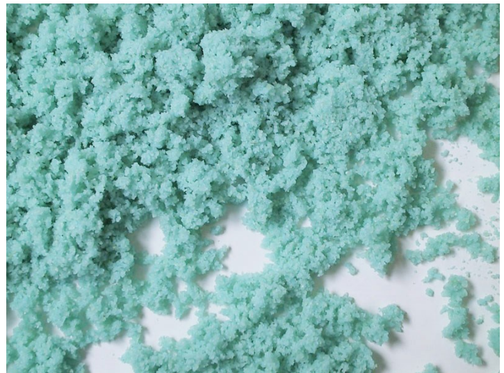
Dough with food colouring (methylene blue)