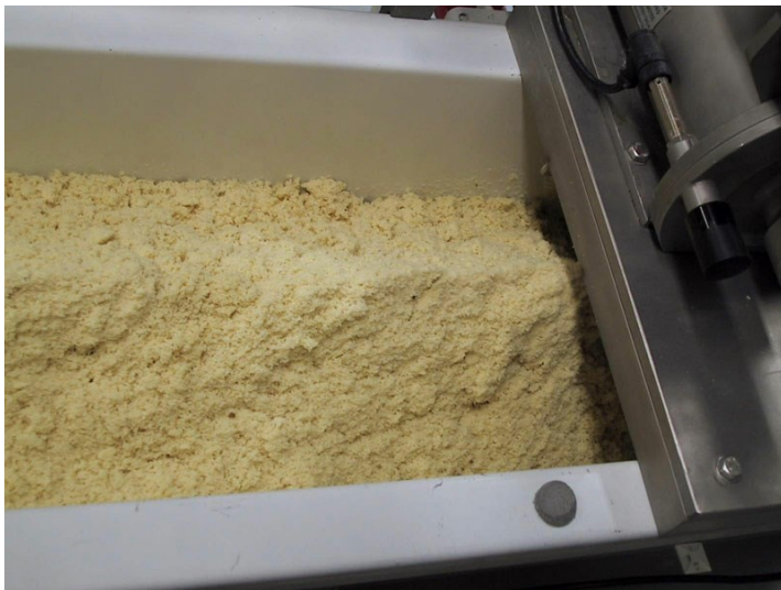
Dough on belt