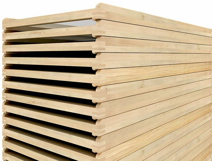
■ Trays stacked