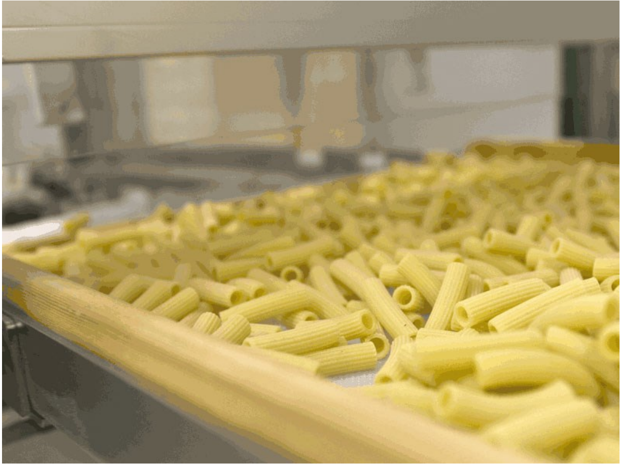
■ Detail of the wooden tray with pasta