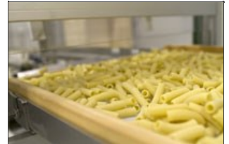
Detail of wooden tray with pasta