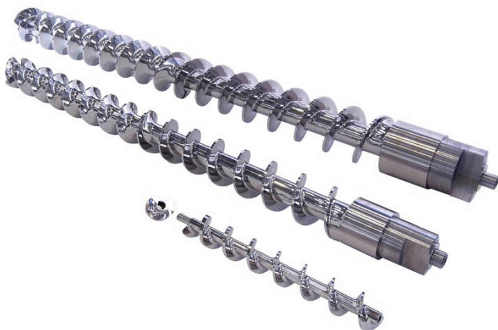
■ Compression worm screws