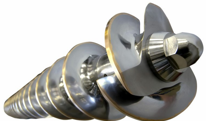
■ Worm screw