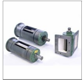
Vacuum seal rotating valves

We guarantee an assistance and reconditioning service for Braibanti vacuum seal rotating valves , thanks to our in-depth knowledge of these components acquired in over 30 years of study.