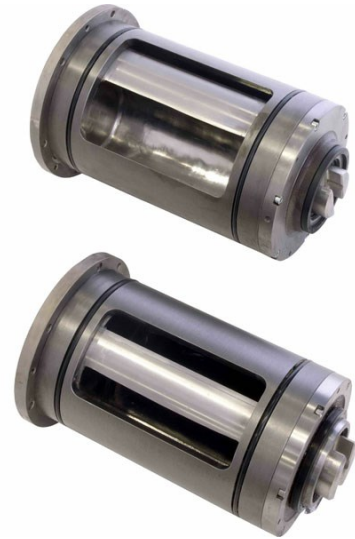
■ Examples of vacuum seal rotating valves