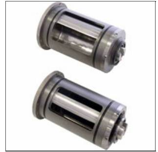
Examples of vacuum seal rotating valves