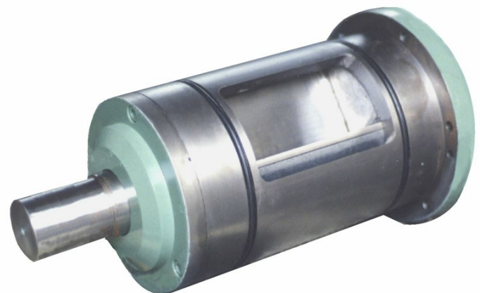
Vacuum seal rotating valve