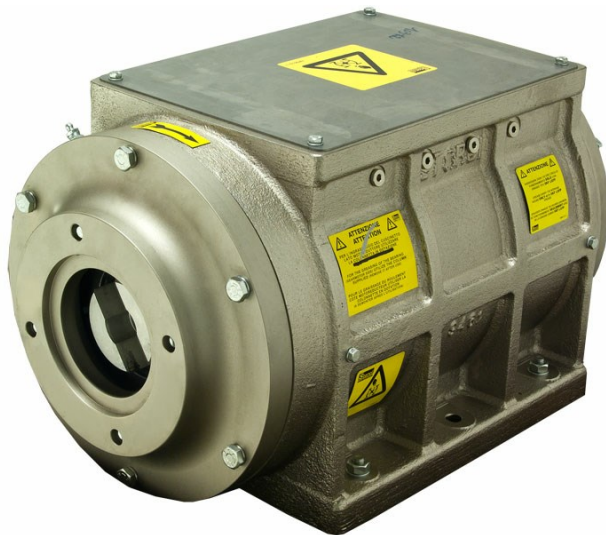
Vacuum seal rotating valve