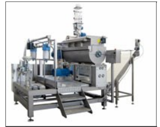
VSF TV/MIX with automatic mixing system