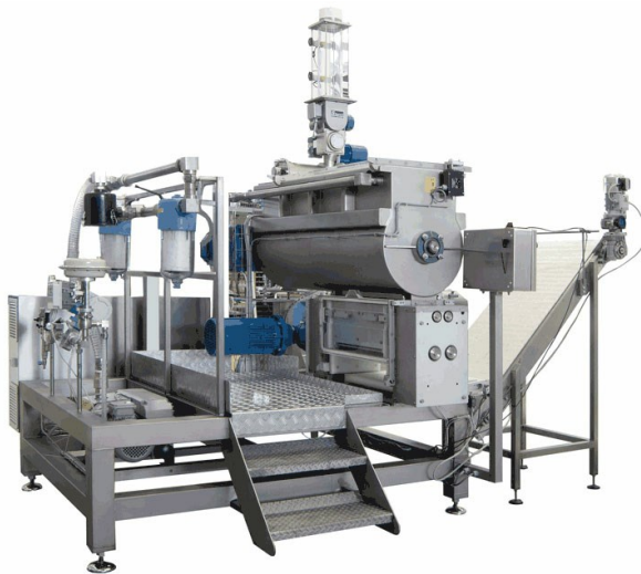
■ VSF TV/MIX with automatic mixing system