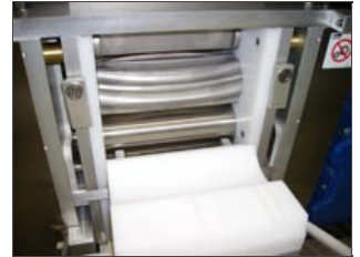
Kneading and calibration system