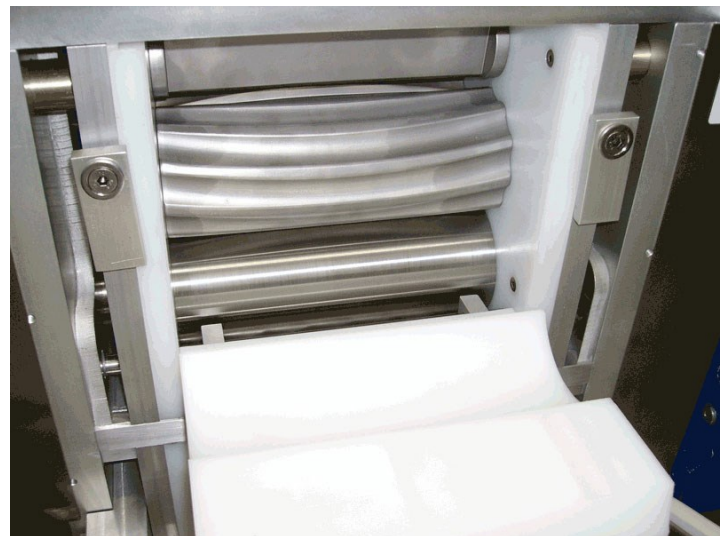
■ Kneading and calibration system