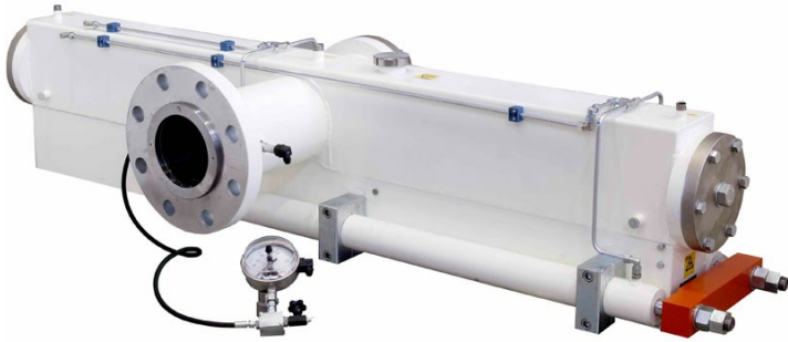
■ Die head for long-cut pasta