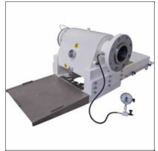
Die head for short-cut pasta