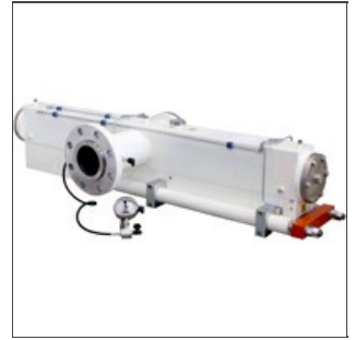
Die head for long-cut pasta

We recondition used die heads/diffuser tubes in our workshop, in particular for Braibanti systems (which we have worked with for over 30 years), offering an excellent assistance and overhaul service thanks to the application of the latest technology.