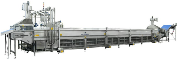
■ Cooker with rods