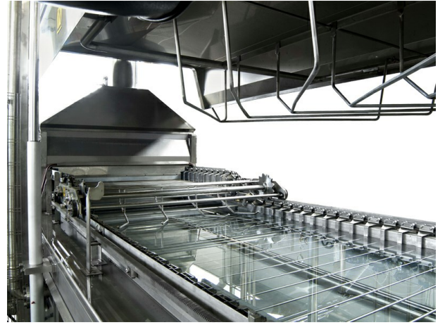
■ Cooker with rods - detail