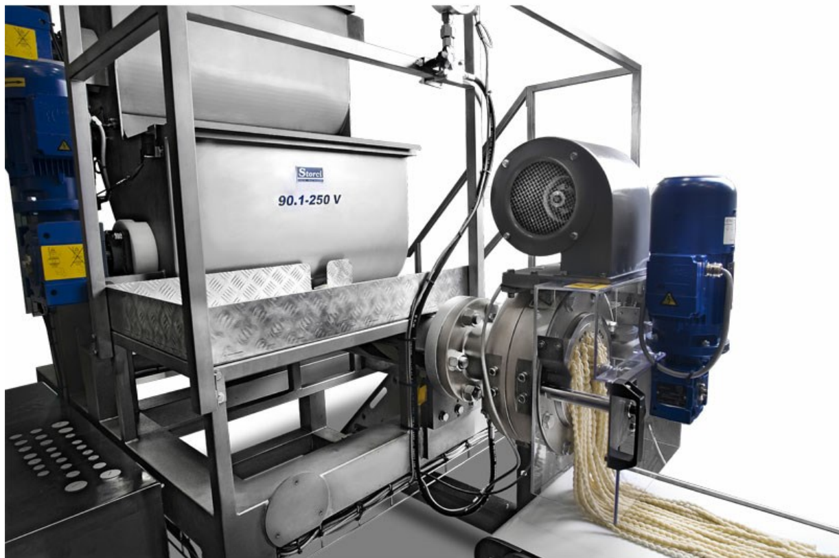
Detail of press V90-250 G