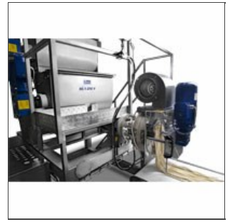
Press V90-250 G