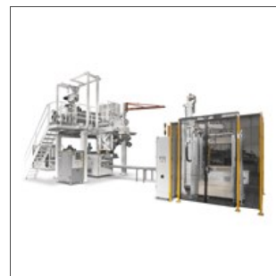
180.1 Press on short-cut pasta line