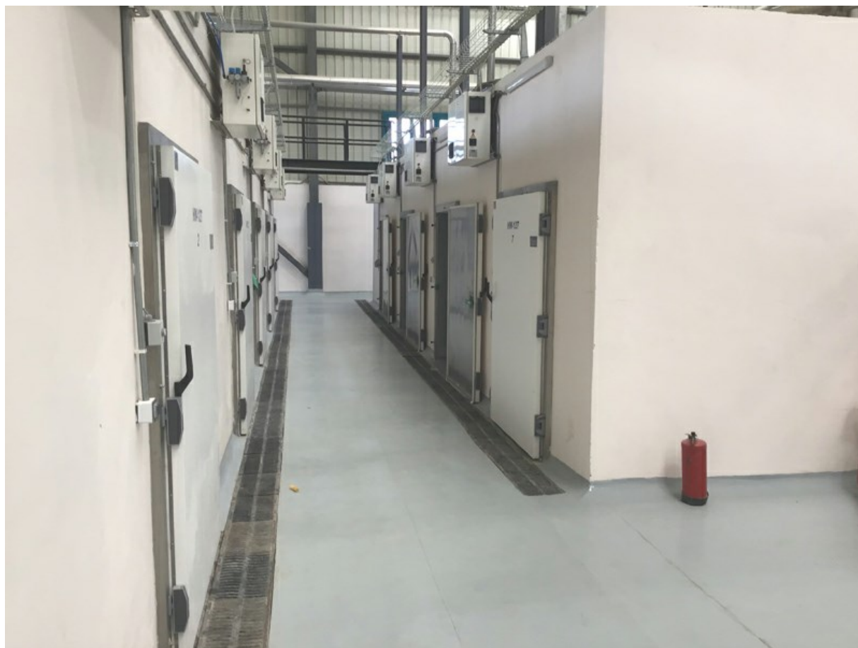
■ Kit for static dryers