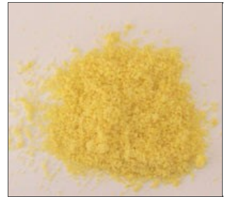
Uniformly ground product