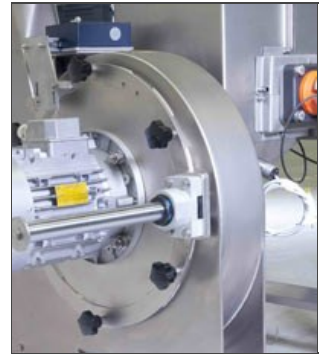
Detail of openable grinder