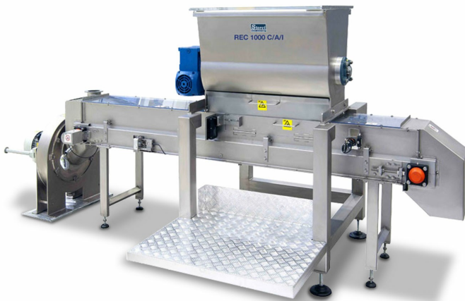
Rec 1000 C/A/I