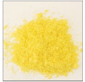
Uniformly ground product