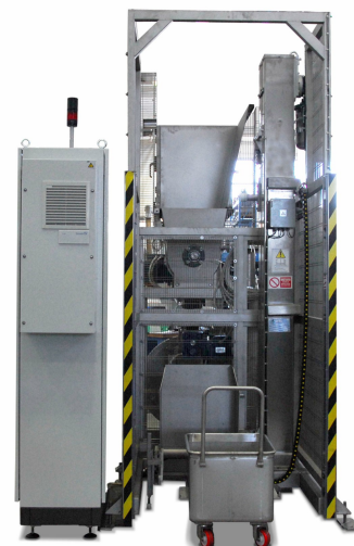
Trolley loading system