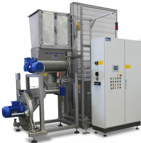
REC 1001 C/A/I