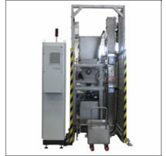
Trolley loading system