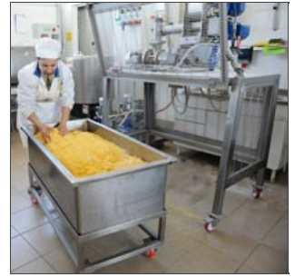
Trolley-mounted tank with dough