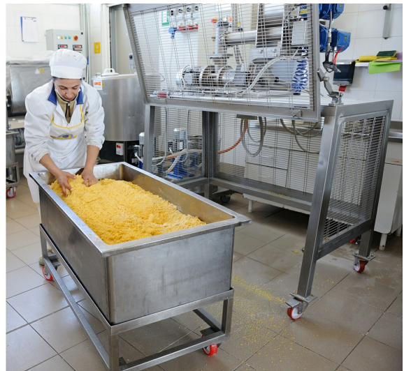
Trolley-mounted tank with dough