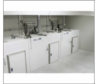
4 and 3 trolley drying cells (not standard model)