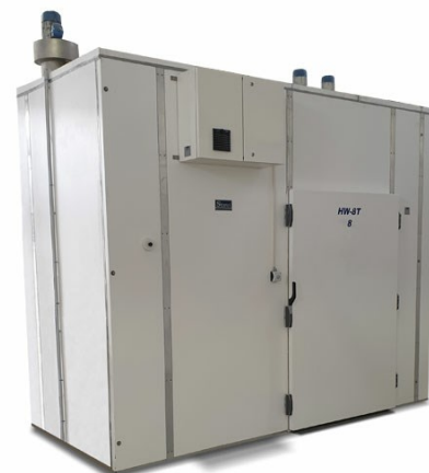
HW drying cell