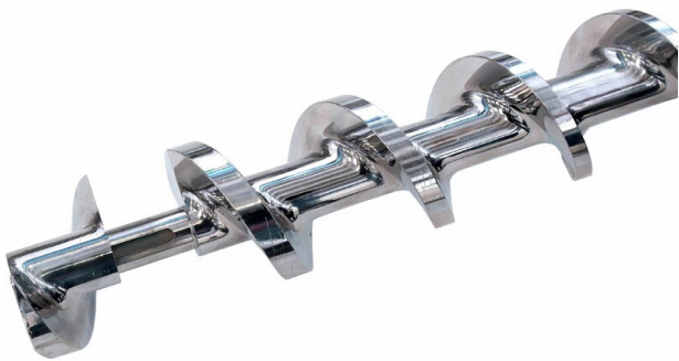
■ Closed compression worm screw